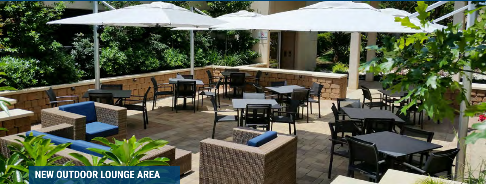
NEW OUTDOOR LOUNGE AREA