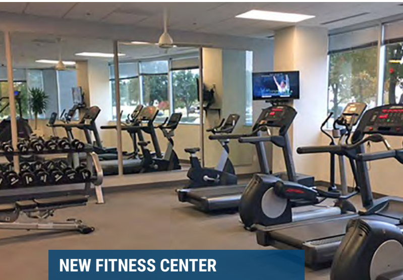
NEW FITNESS CENTER