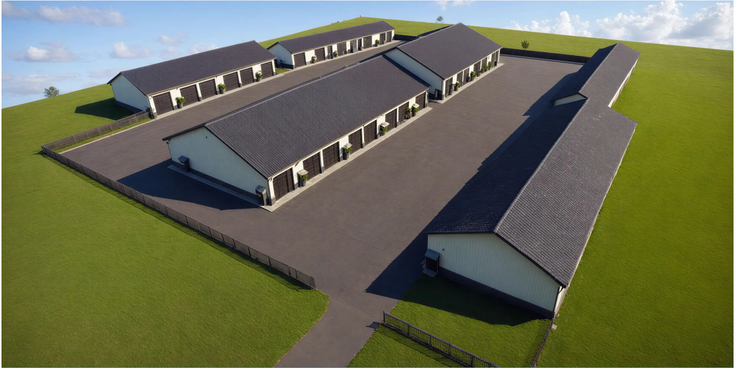
PROPERTY BIRD'S EYE VIEW

6565 STELLHORN ROAD, FORT WAYNE, IN 46815