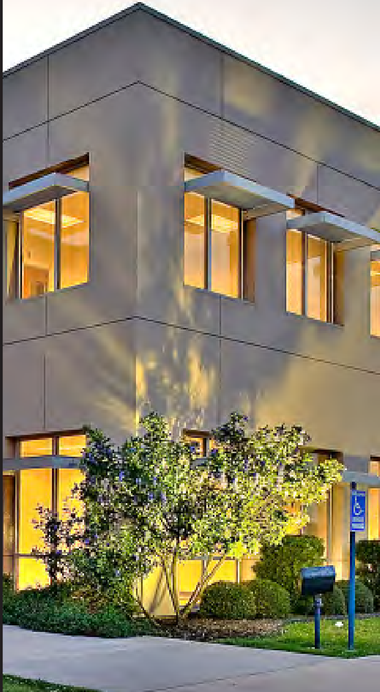
Two Story Office Complex