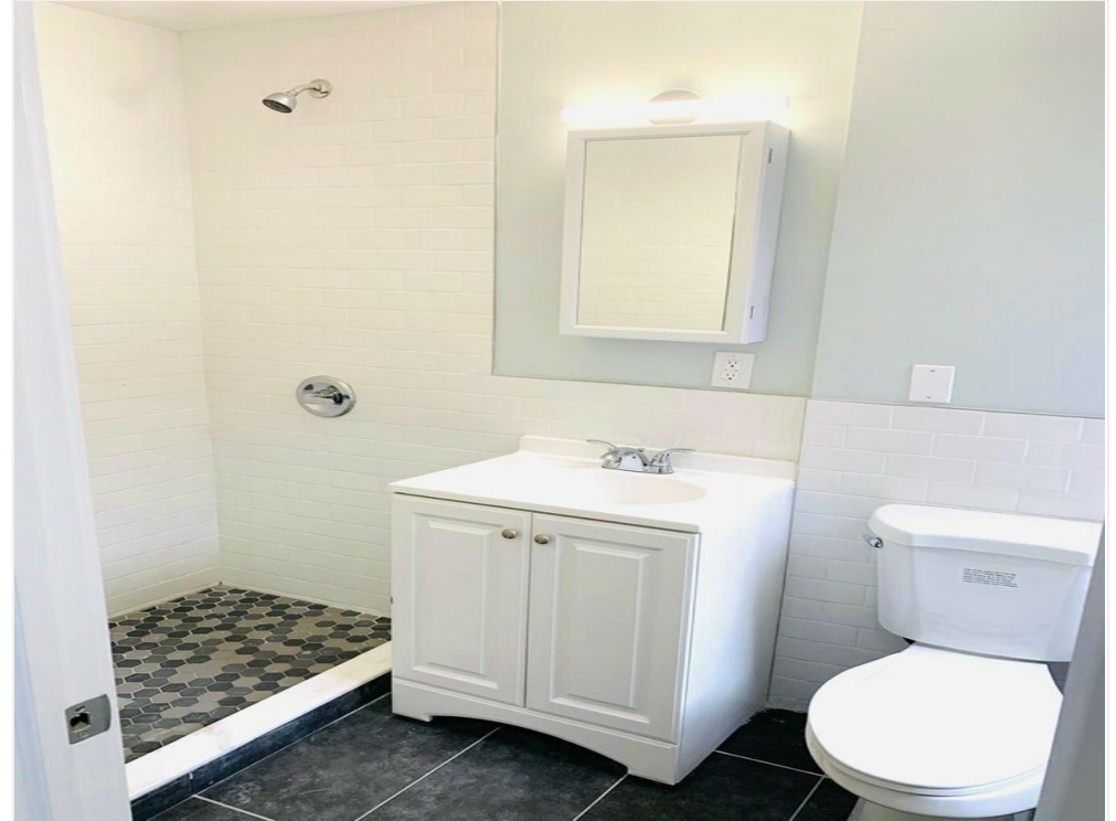
Apt Pic #4