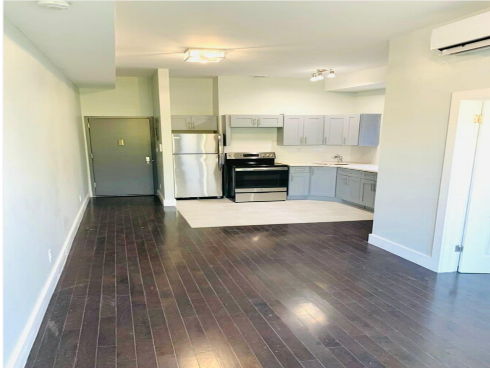
Apt Pic #3