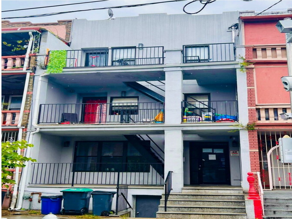
Front Facade Pic