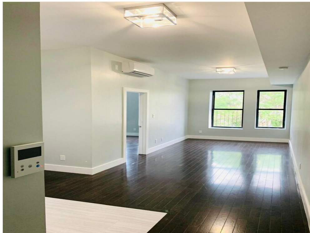
Apt Pic #7