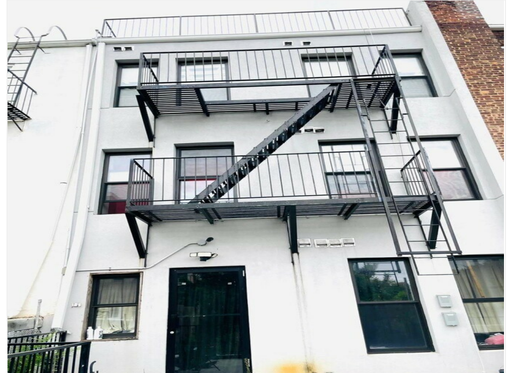
Rear Facade Pic