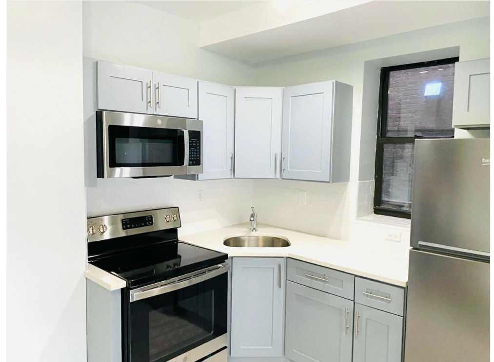
Apt Pic #2