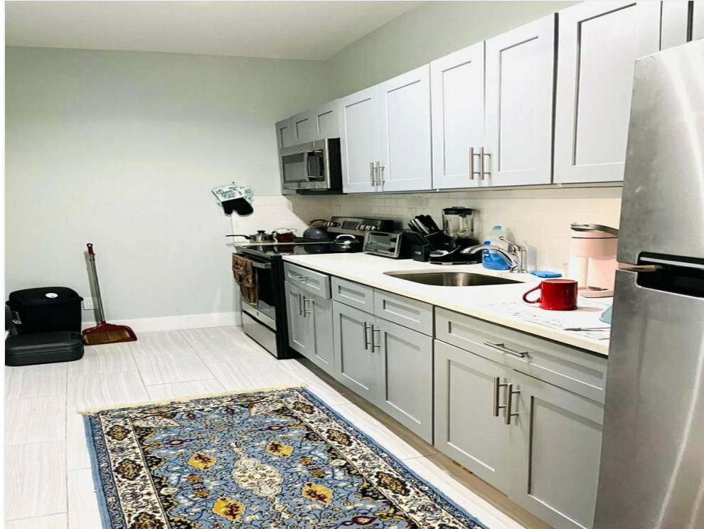
Apt Pic #1