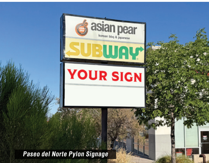
Paseo del Norte Pylon Signage