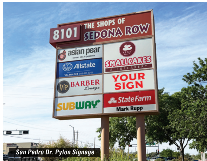
San Pedro Dr. Pylon Signage