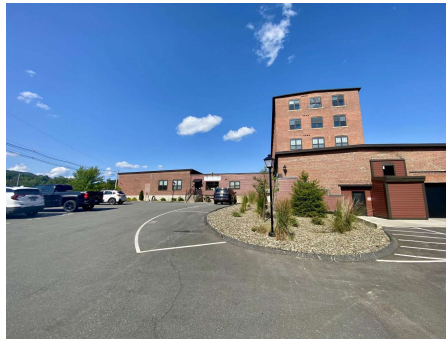
Plenty of On-Site Parking