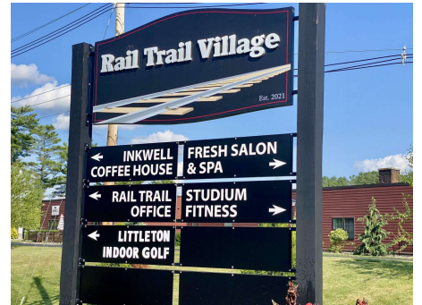
Add Your Name!