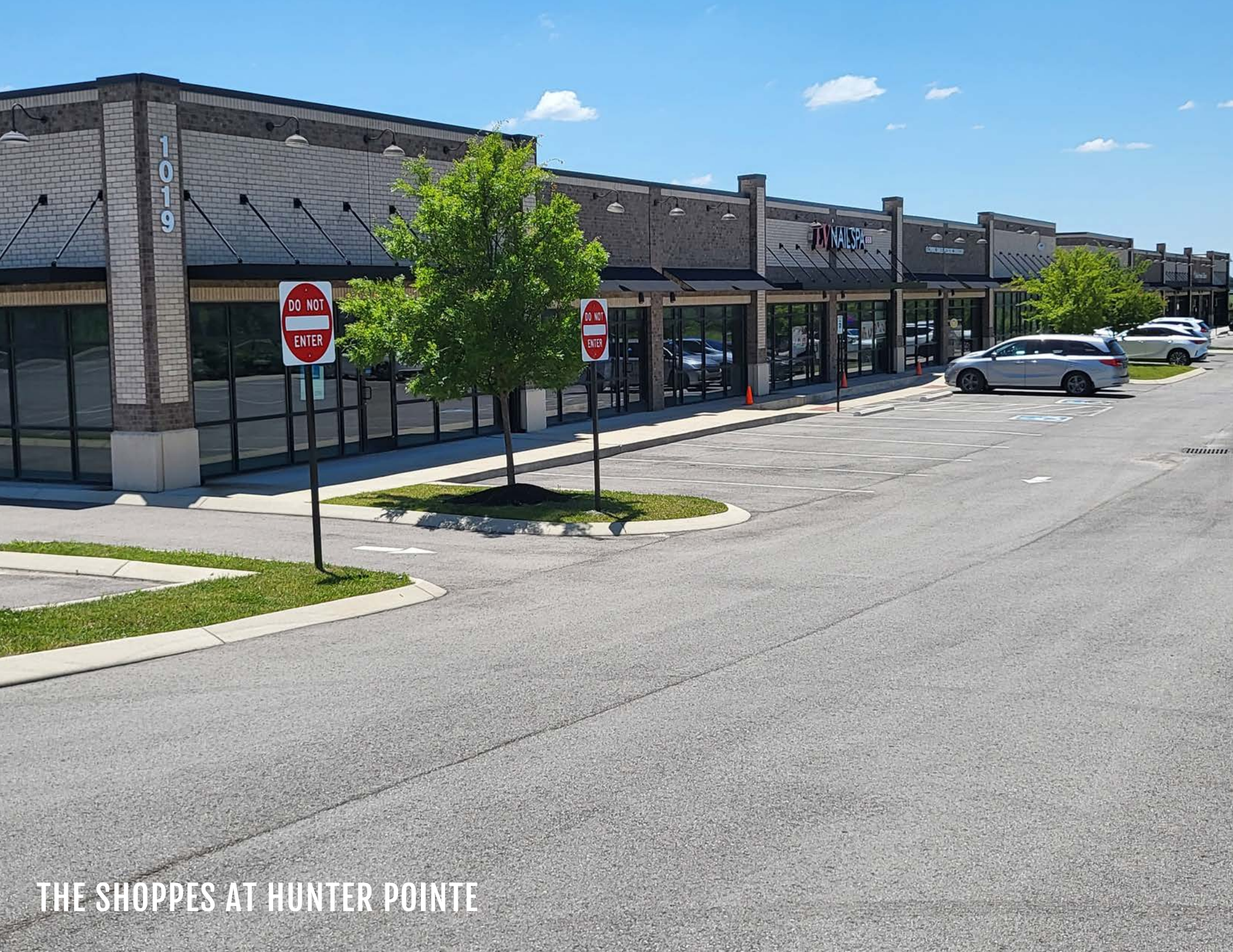
THE SHOPPES AT HUNTER POINTE