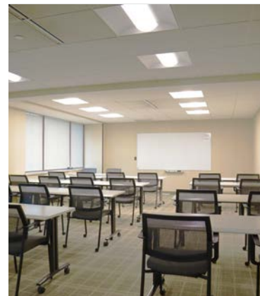
Conference and training room