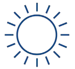
Ample natural light