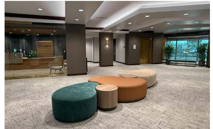
Modernized Lobby Experience