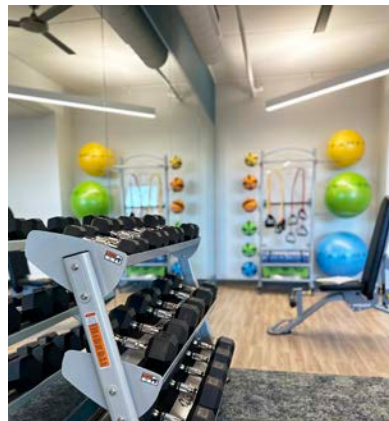
Tenant fitness center