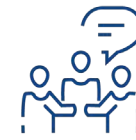
Shared meeting spaces