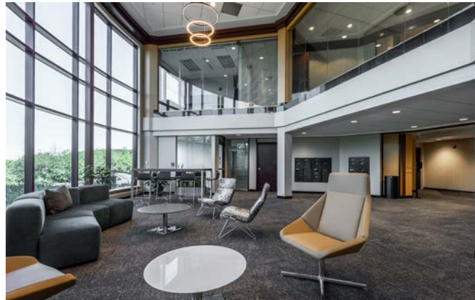
Upscale tenant lounge and atrium