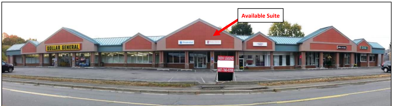
Figure 3 – Northern (front) elevation of the building