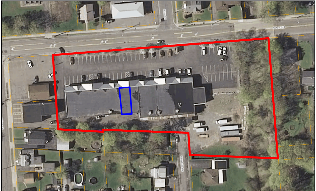
Figure 2 – Aerial photograph of site (available space outlined in blue)