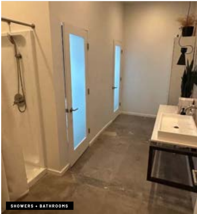
SHOWERS + BATHROOMS