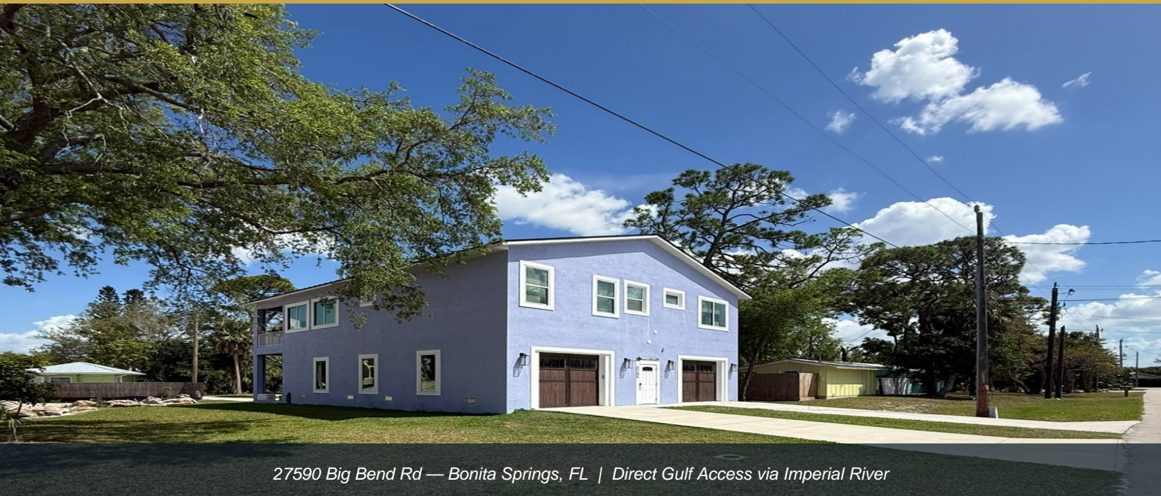
27590 Big Bend Rd — Bonita Springs, FL | Direct Gulf Access via Imperial River