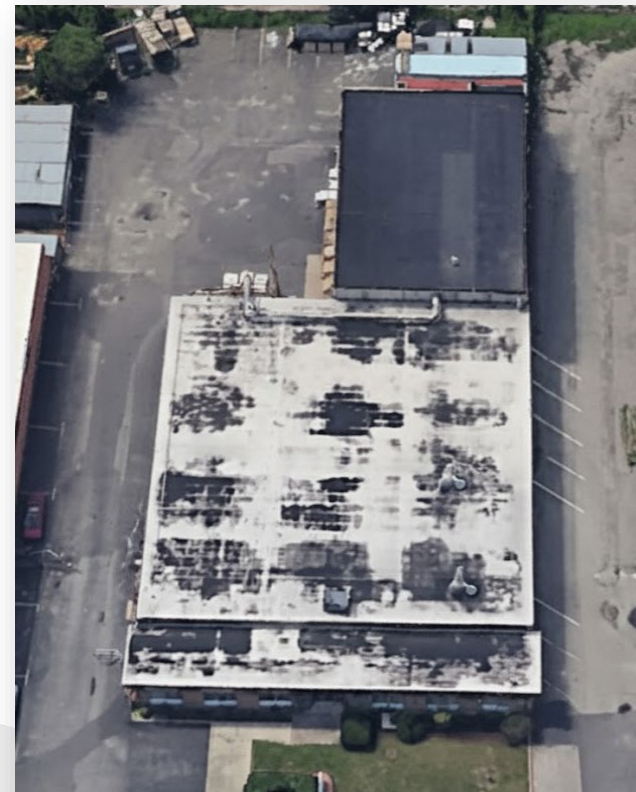
Photo Digitally Enhanced to Remove Cars

For Information Contact Exclusive Broker: