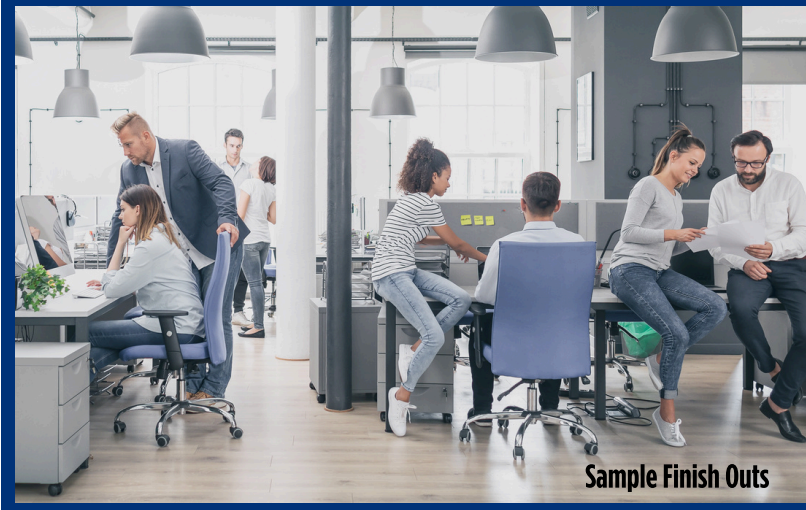
Sample Finish Outs