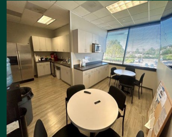
Kitchen/ Break Room

© 2025 CBRE, Inc. All rights reserved. This information has been obtained from sources believed reliable but has not been verified for accuracy or completeness. CBRE, Inc. makes no guarantee, representation or warranty and accepts no responsibility or liability as to the accuracy, completeness, or reliability of the information contained herein. You should conduct a careful, independent investigation of the property and verify all information. Any reliance on this information is solely at your own risk. CBRE and the CBRE logo are service marks of CBRE, Inc. All other marks displayed on this document are the property of their respective owners, and the use of such marks does not imply any affiliation with or endorsement of CBRE. Photos herein are the property of their respective owners. Use of these images without the express written consent of the owner is prohibited.