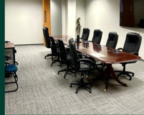
Large Conference Room