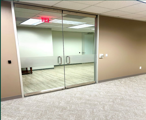
Elevator Lobby Exposure