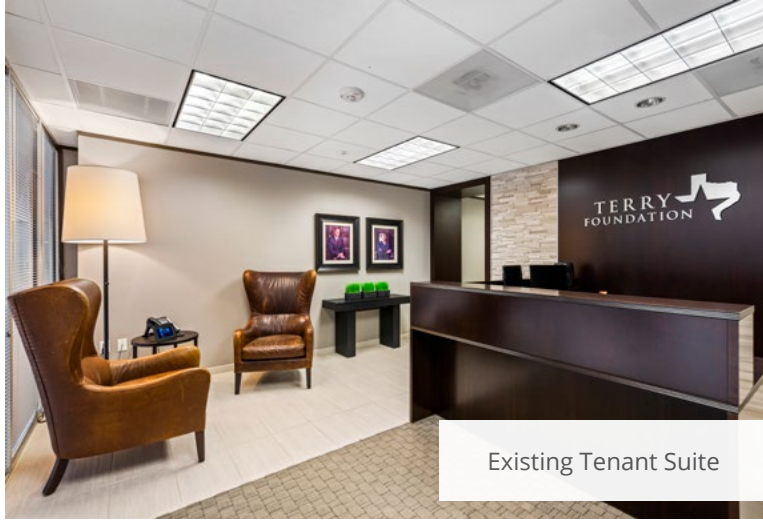
Existing Tenant Suite