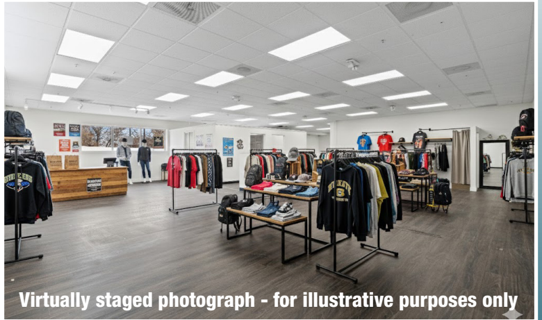
Virtually staged photograph - for illustrative purposes only