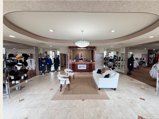
THE INTERIOR ———