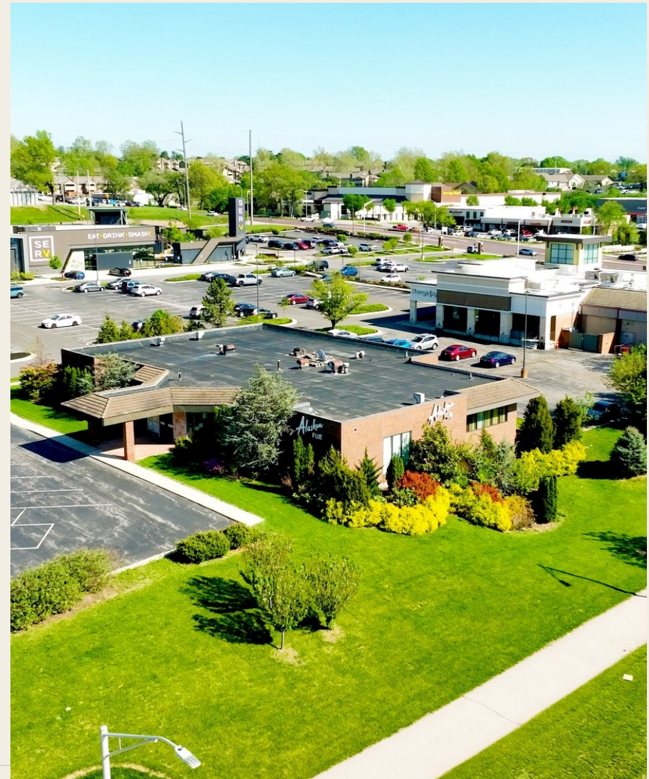
East side of Metcalf at 90th Street.

Corner of 90th & Metcalf · 32,000+ VPD on Metcalf (KDOT).