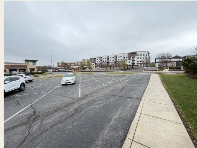
THE CONTEXT ———