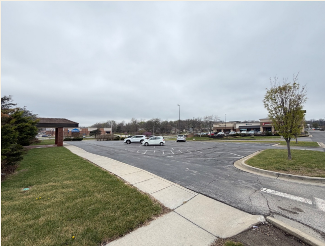
THE PARKING ———