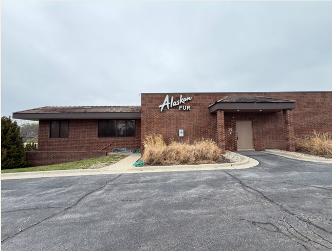
THE EXTERIOR ———