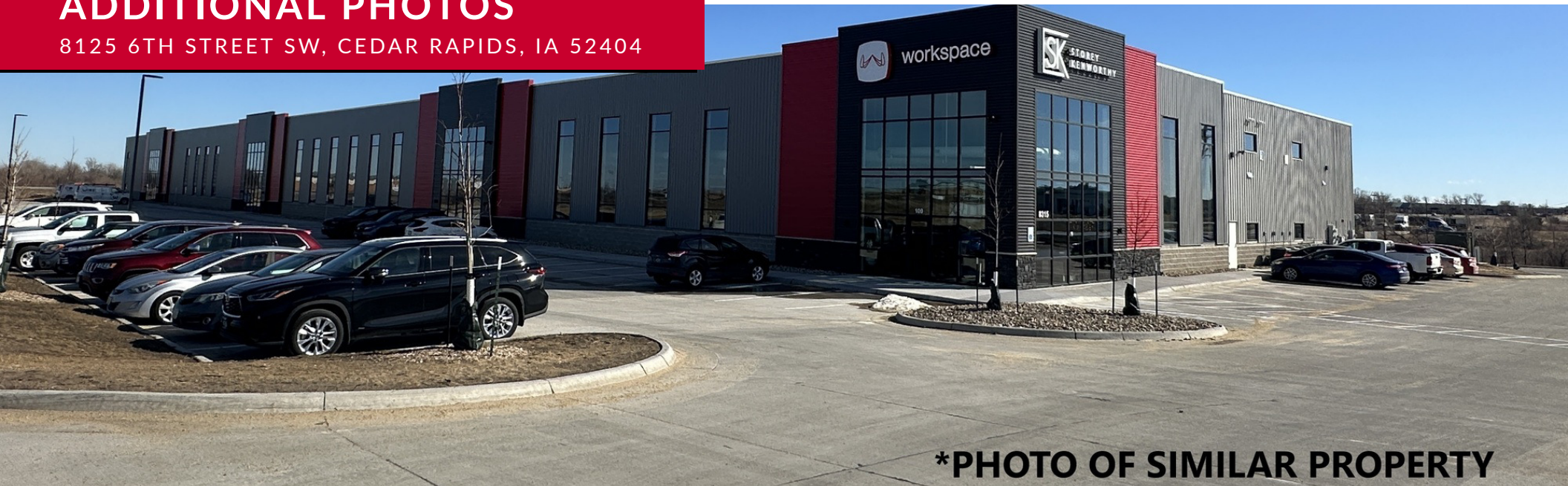
*PHOTO OF SIMILAR PROPERTY

8125 6TH STREET SW, CEDAR RAPIDS, IA 52404