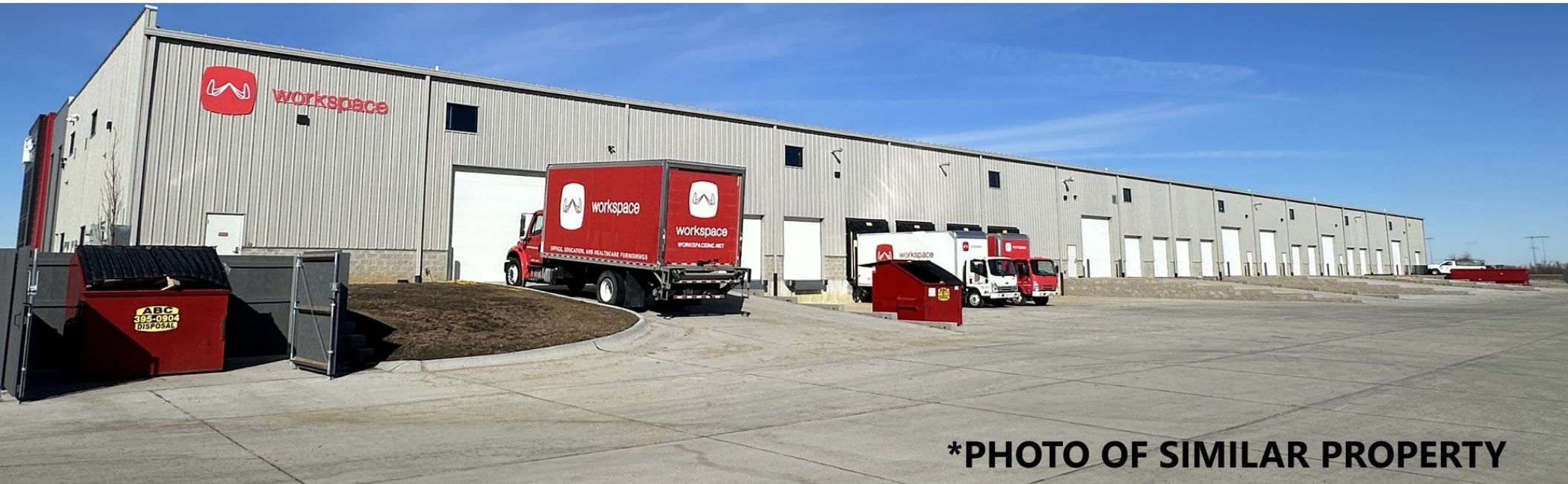
*PHOTO OF SIMILAR PROPERTY