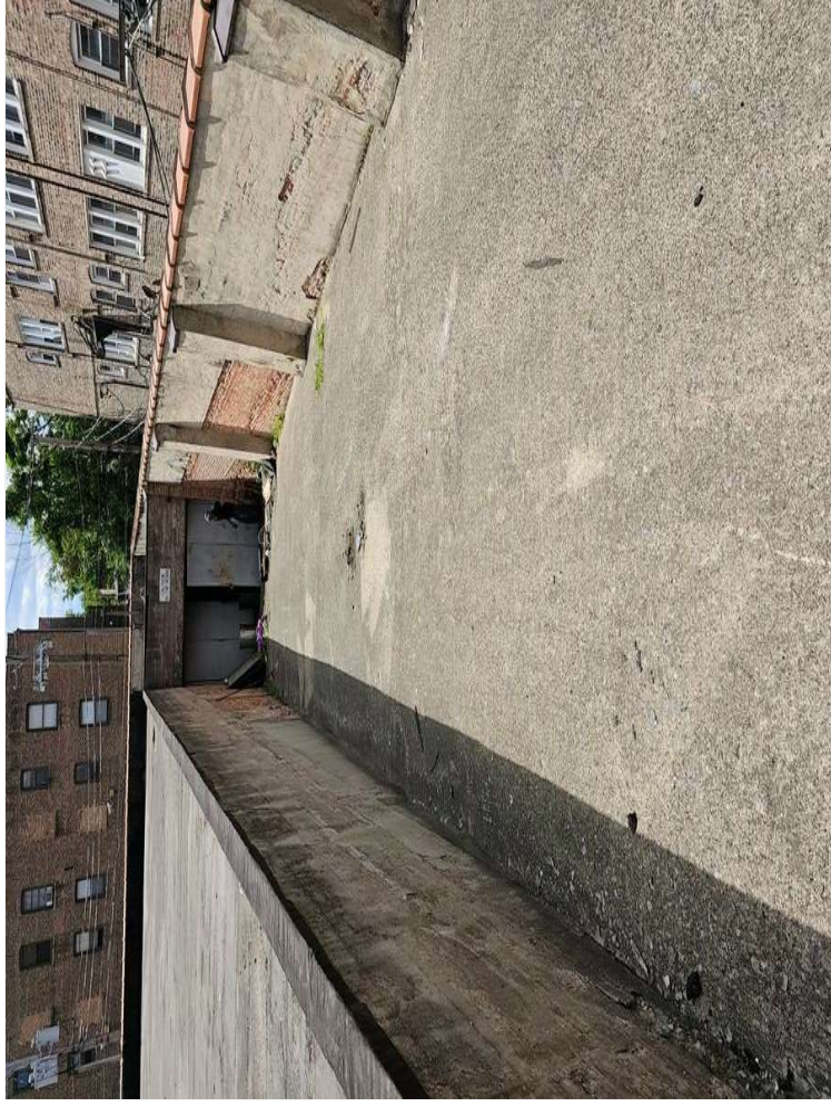
RAMP TO INSIDE PARKING