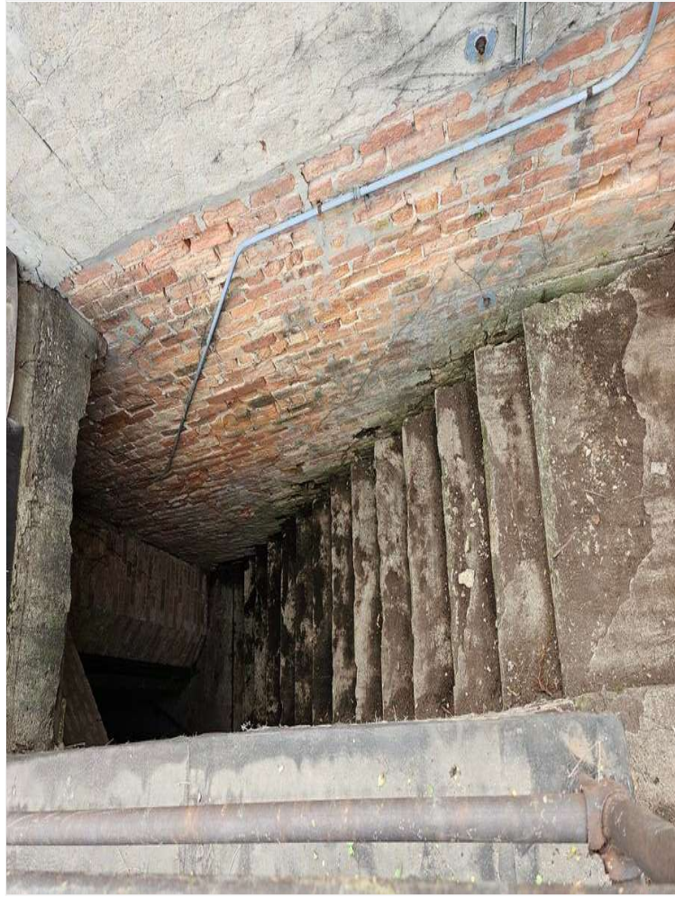
STAIRS TO INSIDE PARKING