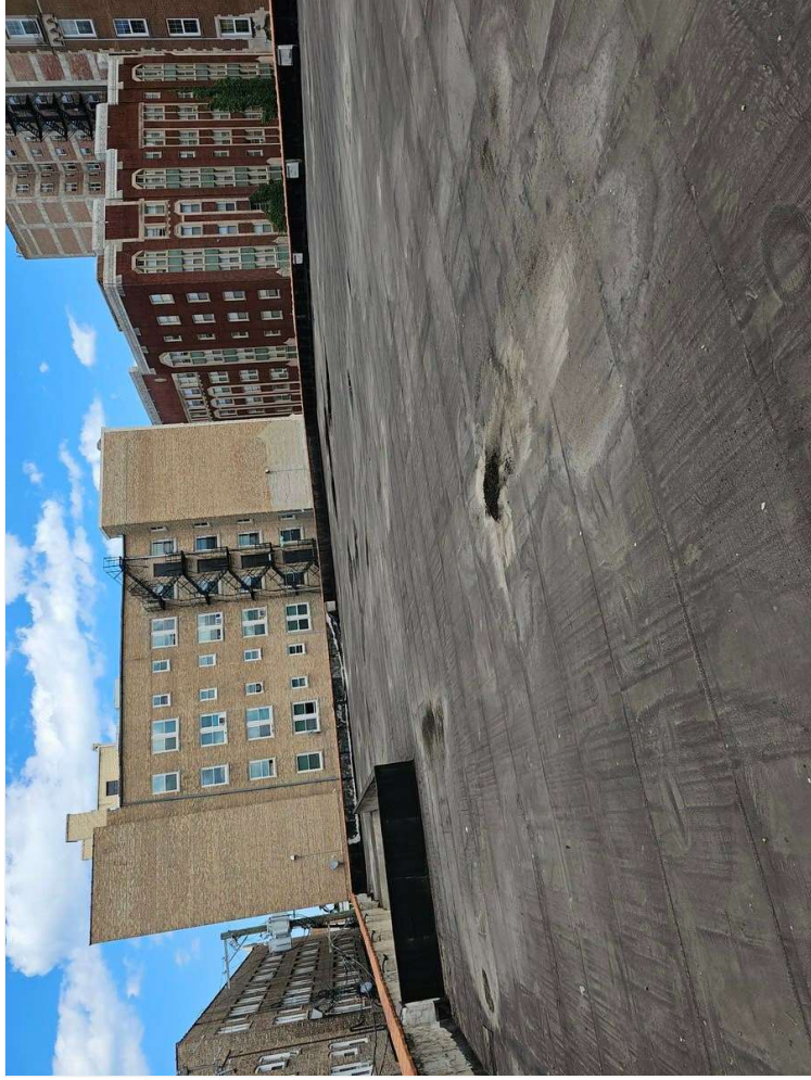
ROOF TOP PARKING