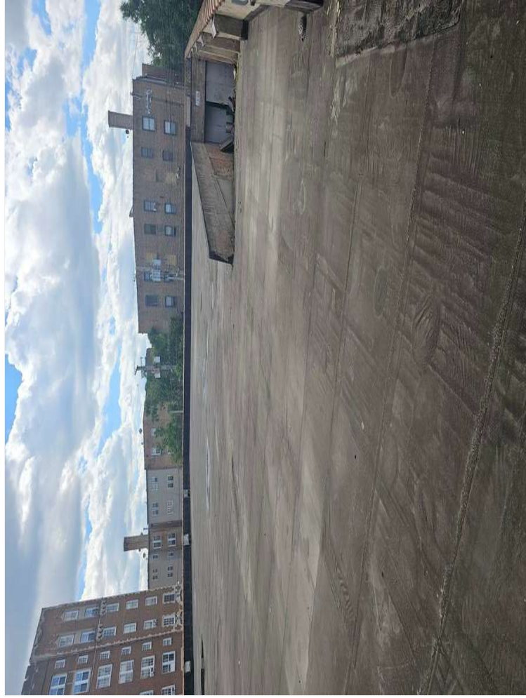
ROOF TOP PARKING