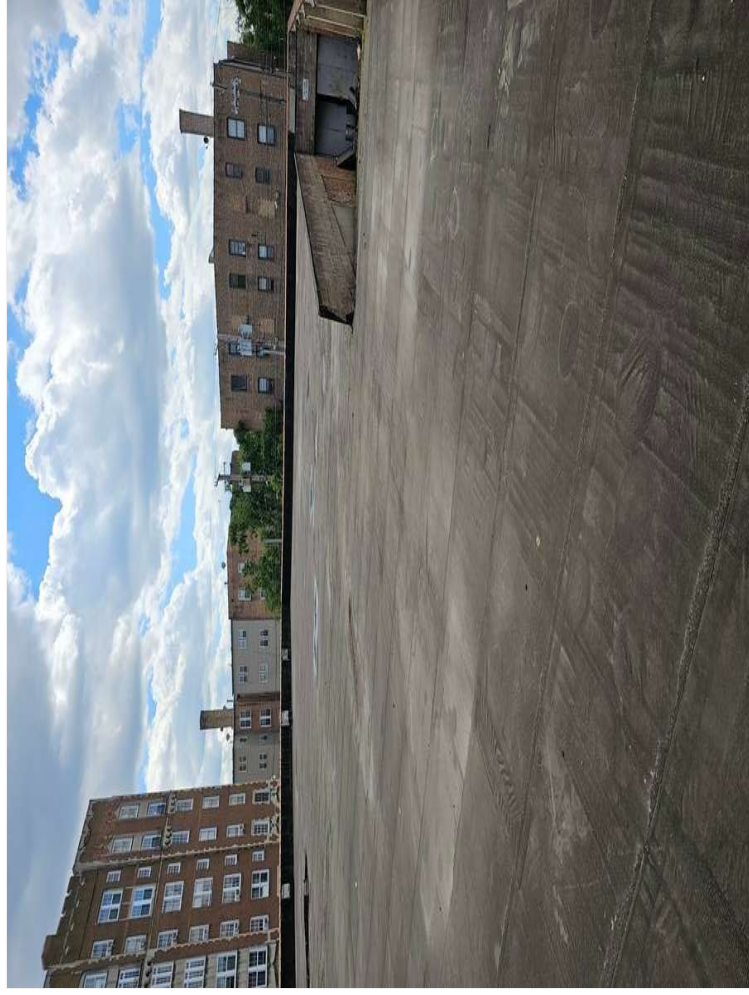
ROOF TOP PARKING