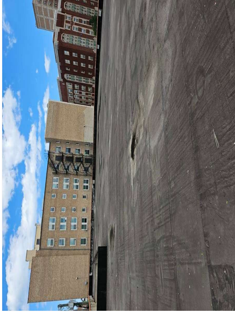
ROOF TOP PARKING