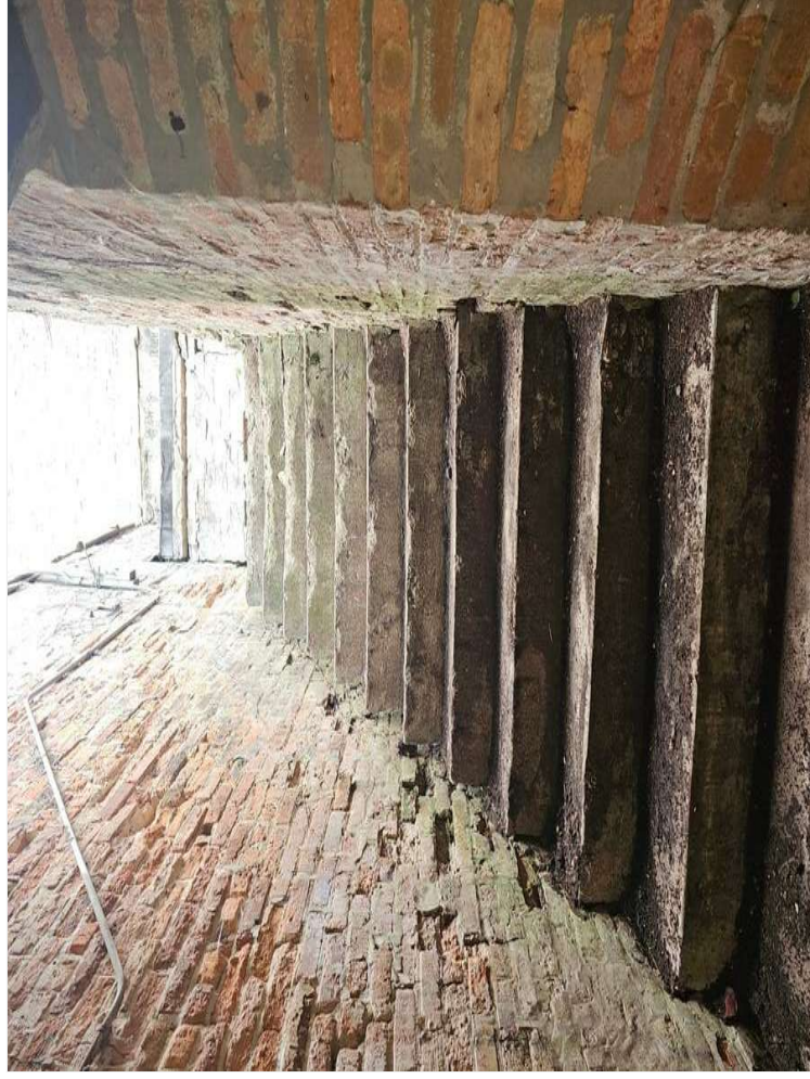
STAIRS TO INSIDE PARKING