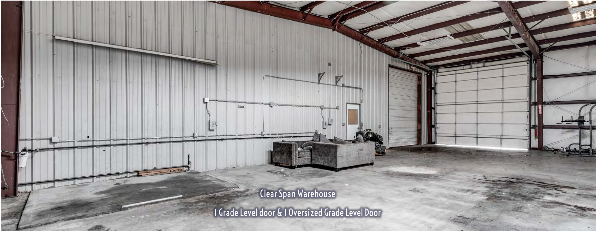
Clear Span Warehouse