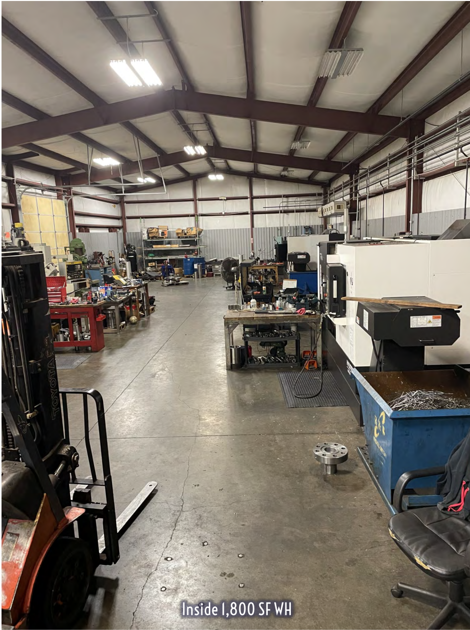
Inside 1,800 SF WH