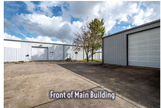
Front of Main Building