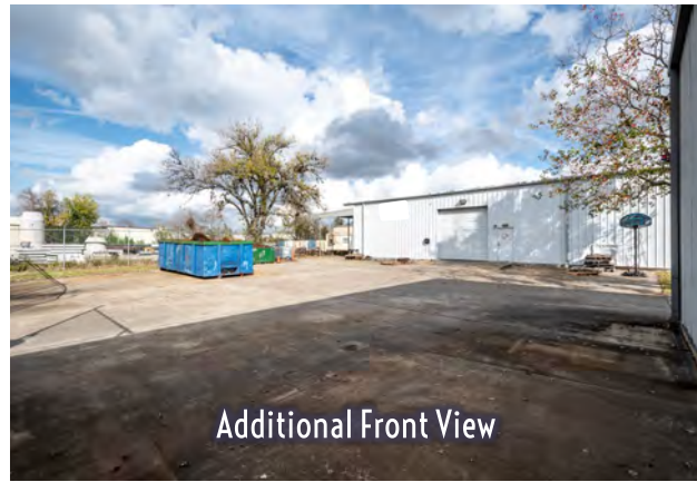
Additional Front View