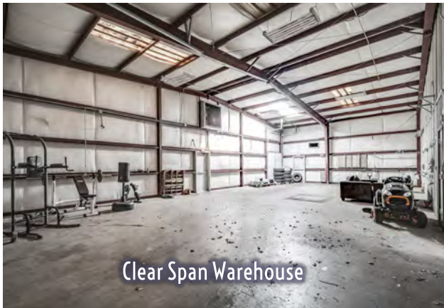
Clear Span Warehouse