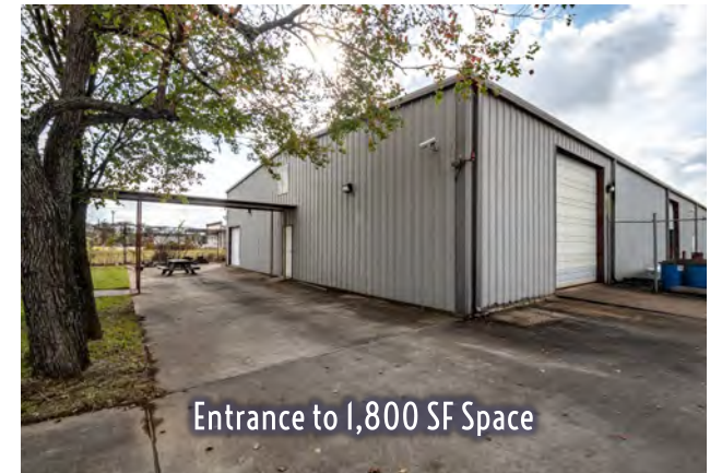
Entrance to 1,800 SF Space