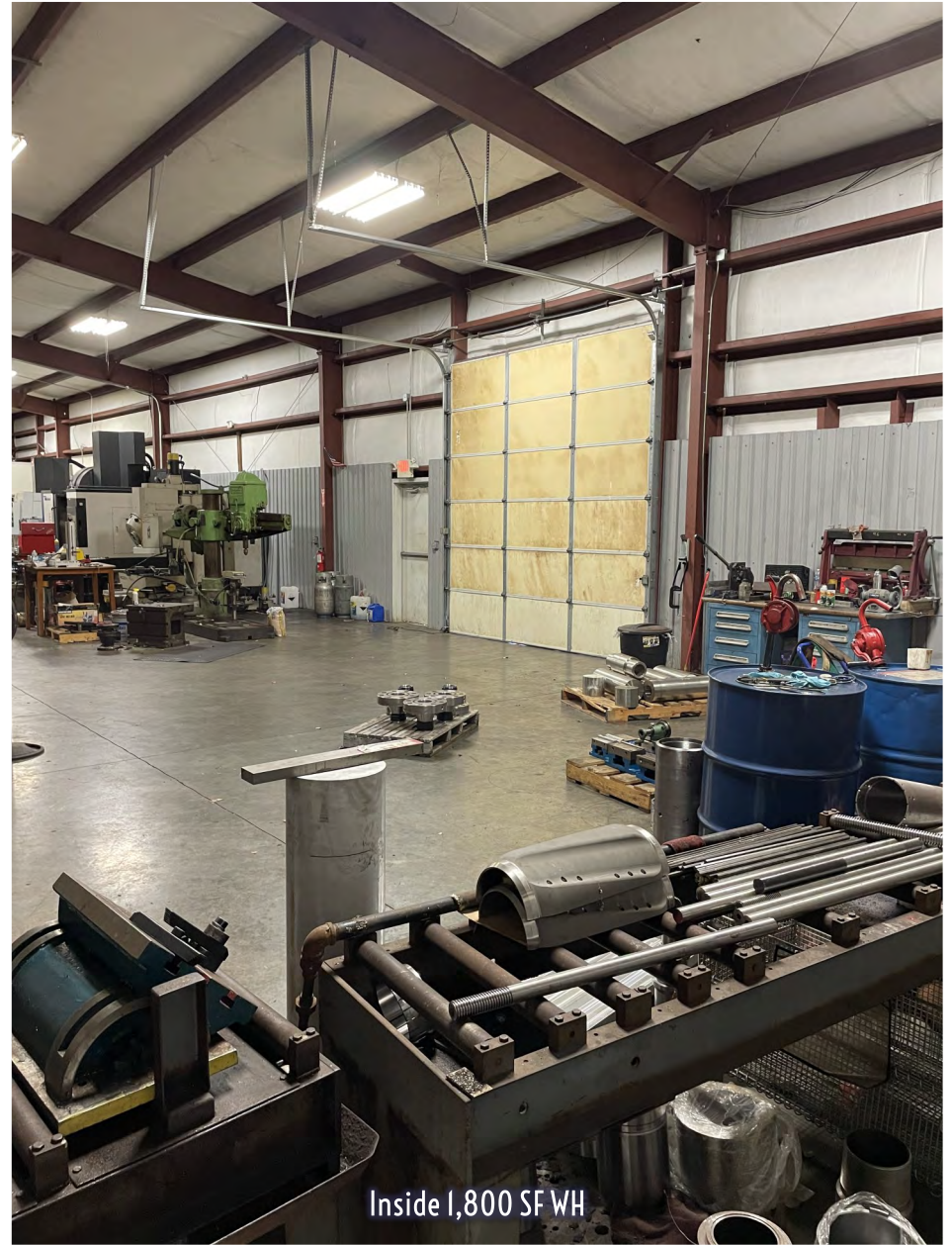
Inside 1,800 SF WH