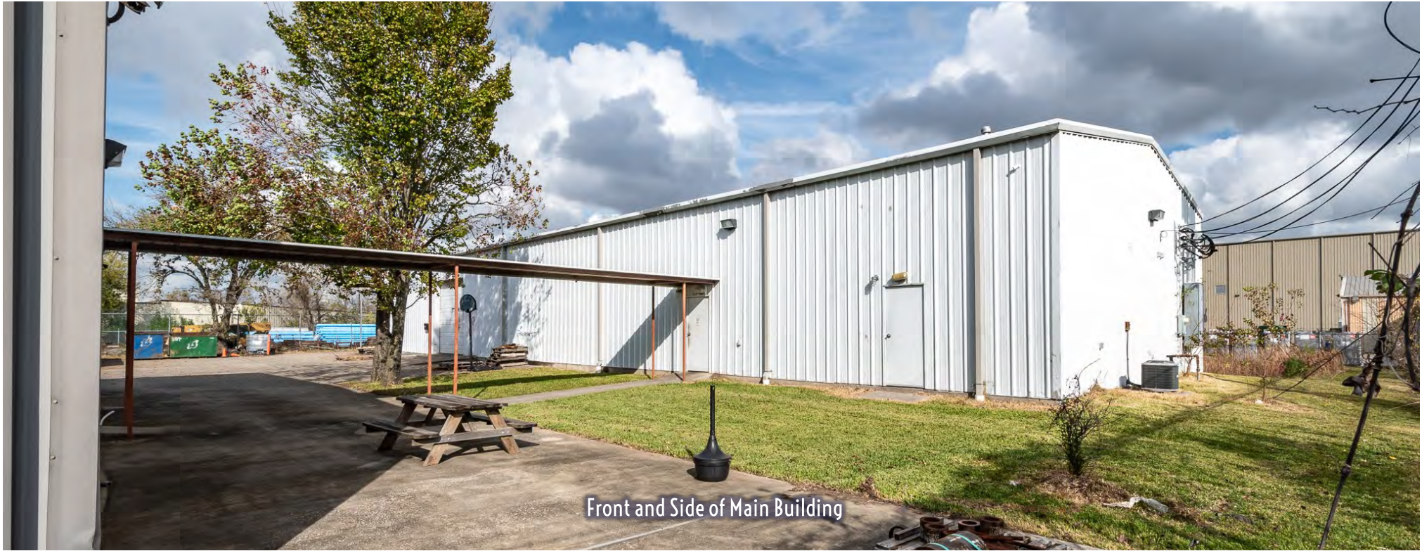
Front and Side of Main Building