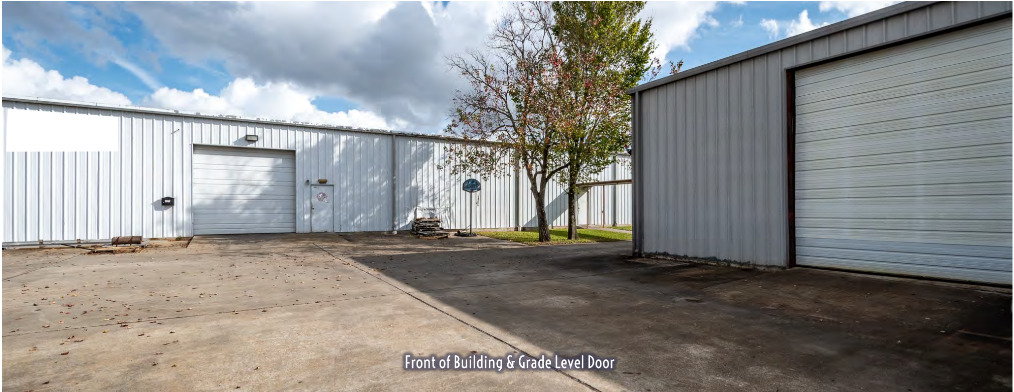
Front of Building & Grade Level Door