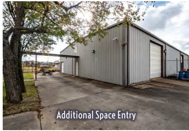
Additional Space Entry