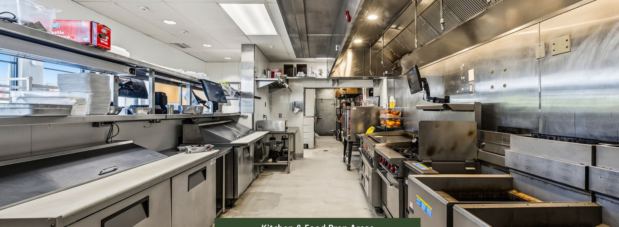
Kitchen & Food Prep Areas