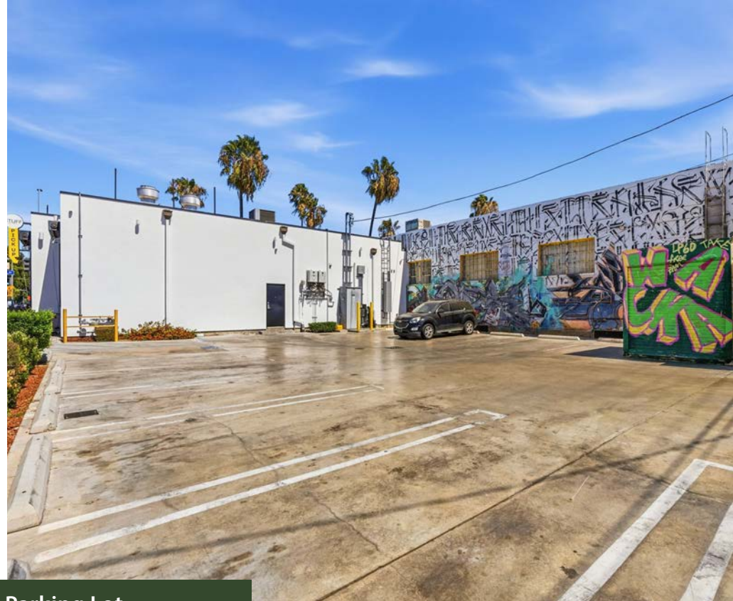
Rear Onsite Parking Lot