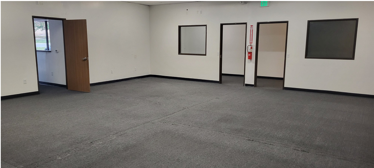
14311 E. 4th Ave. Main open area

CHARLES NUSBAUM Antonoff & Co. Brokerage, Inc. CO #EA040028301 303.454.5420 cnusbaum@antonoff.com