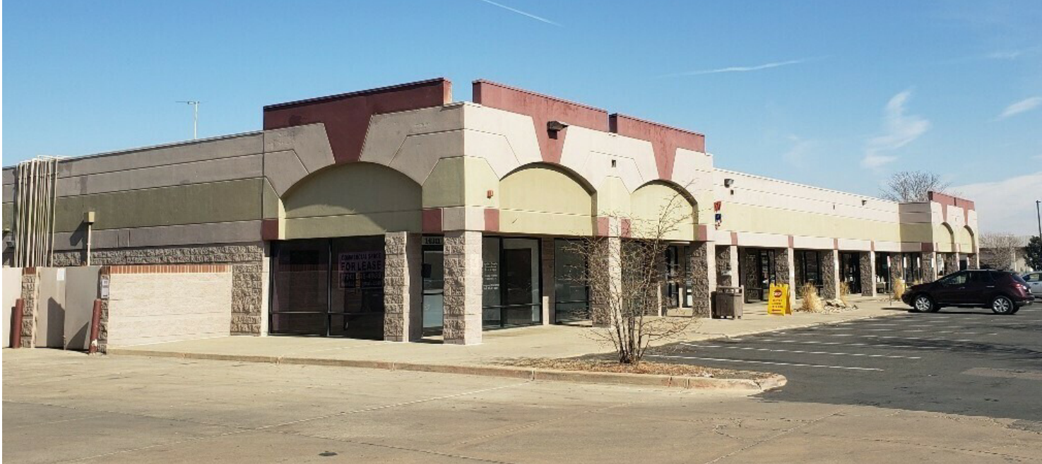
14311 E. 4th Ave. Exterior