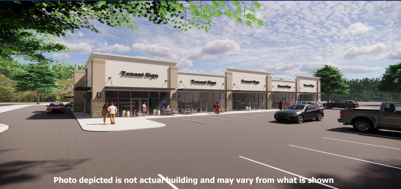
Photo depicted is not actual building and may vary from what is shown