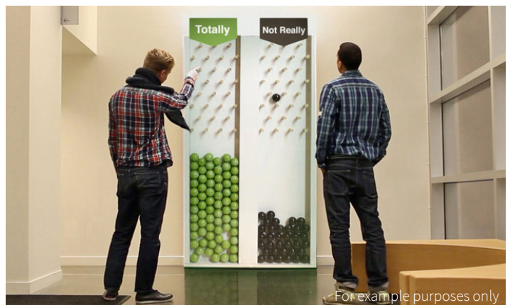
For example purposes only