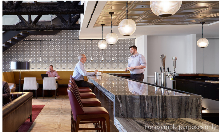
For example purposes only