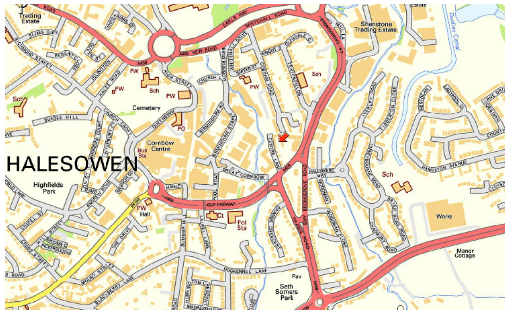
Licence Number - 100022432 - Not to Scale

Strictly by prior arrangement with the agent.