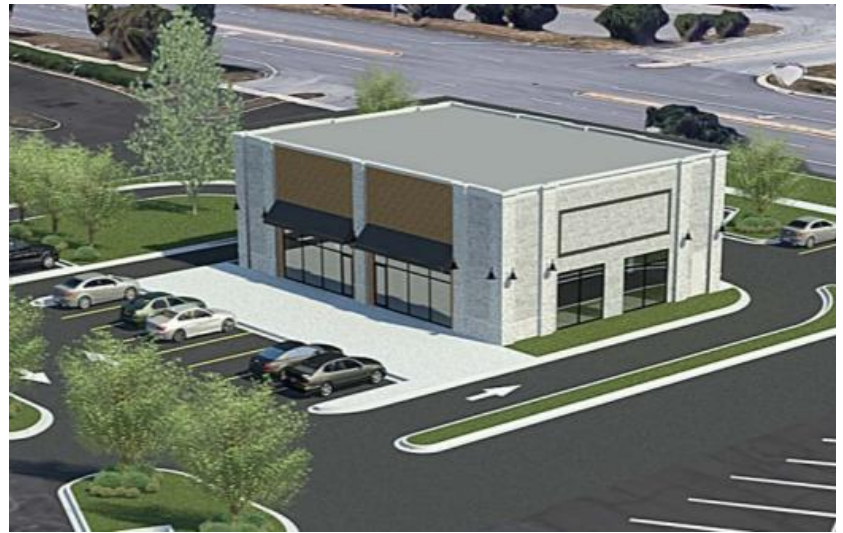
3,500 SF Single or Multi-Tenant Building