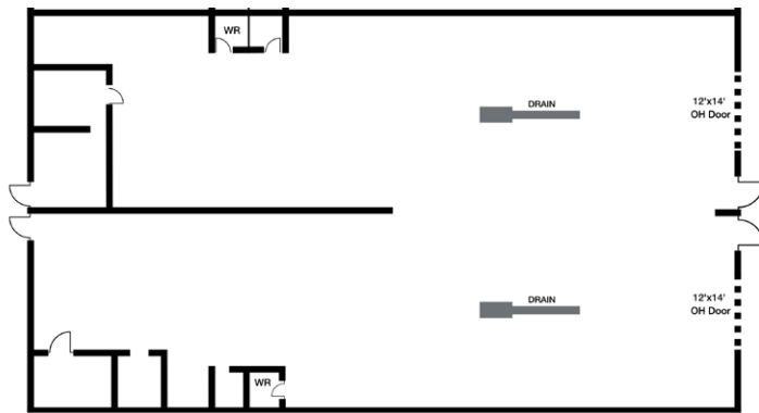
FOR ILLUSTRATIVE PURPOSES - NOT TO SCALE - NOT EXACT