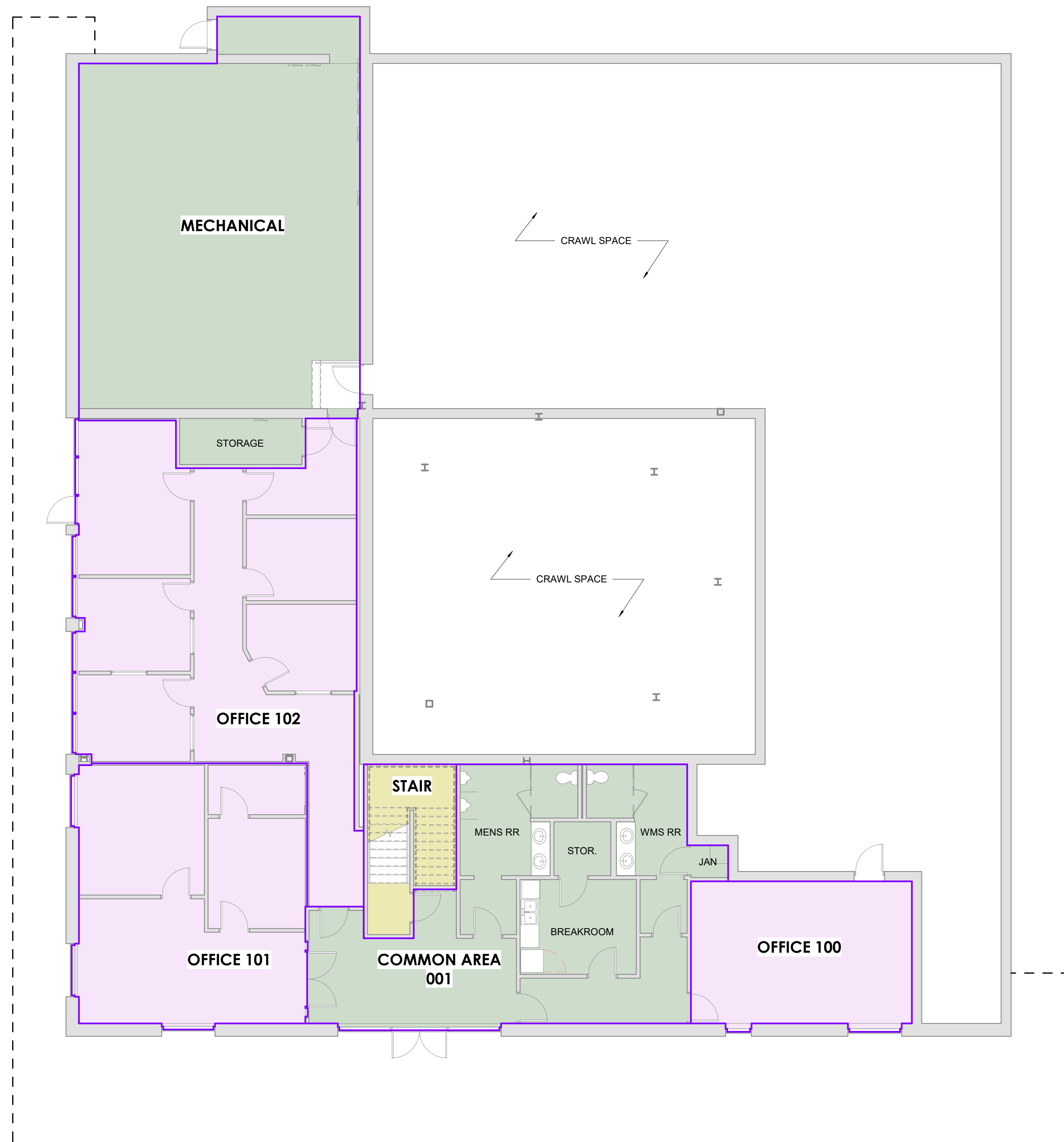
1 FIRST FLOOR 1/8" = 1'-0" 0 4 8 16'

TOTAL INTERIOR GROSS SQUARE FEET 1ST FLOOR: 4,803 SF 2ND FLOOR: 11,373 SF TOTAL = 16,176