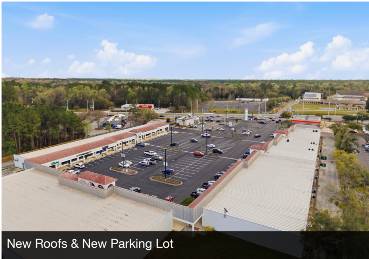
New Roofs & New Parking Lot