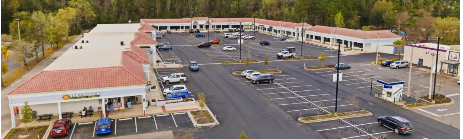
New Tenants Jeremiah's Italian Ice & Fyzical Therapy