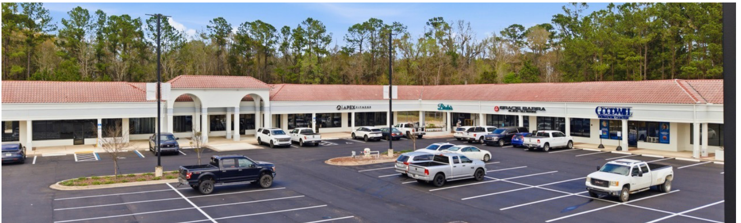
New Tenants Apex Fitness, Birdie's Dinner & Dessert, and Goodwill