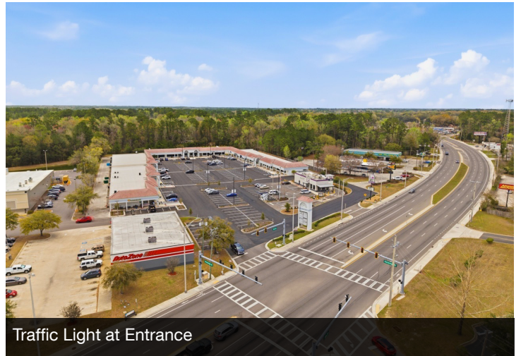
Traffic Light at Entrance