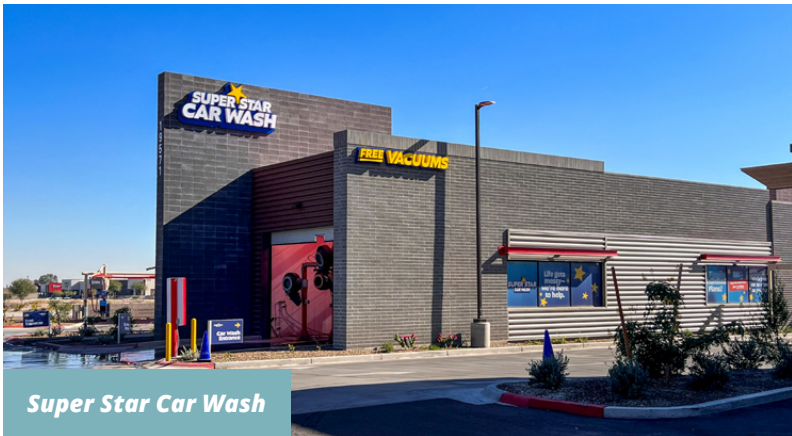
Super Star Car Wash