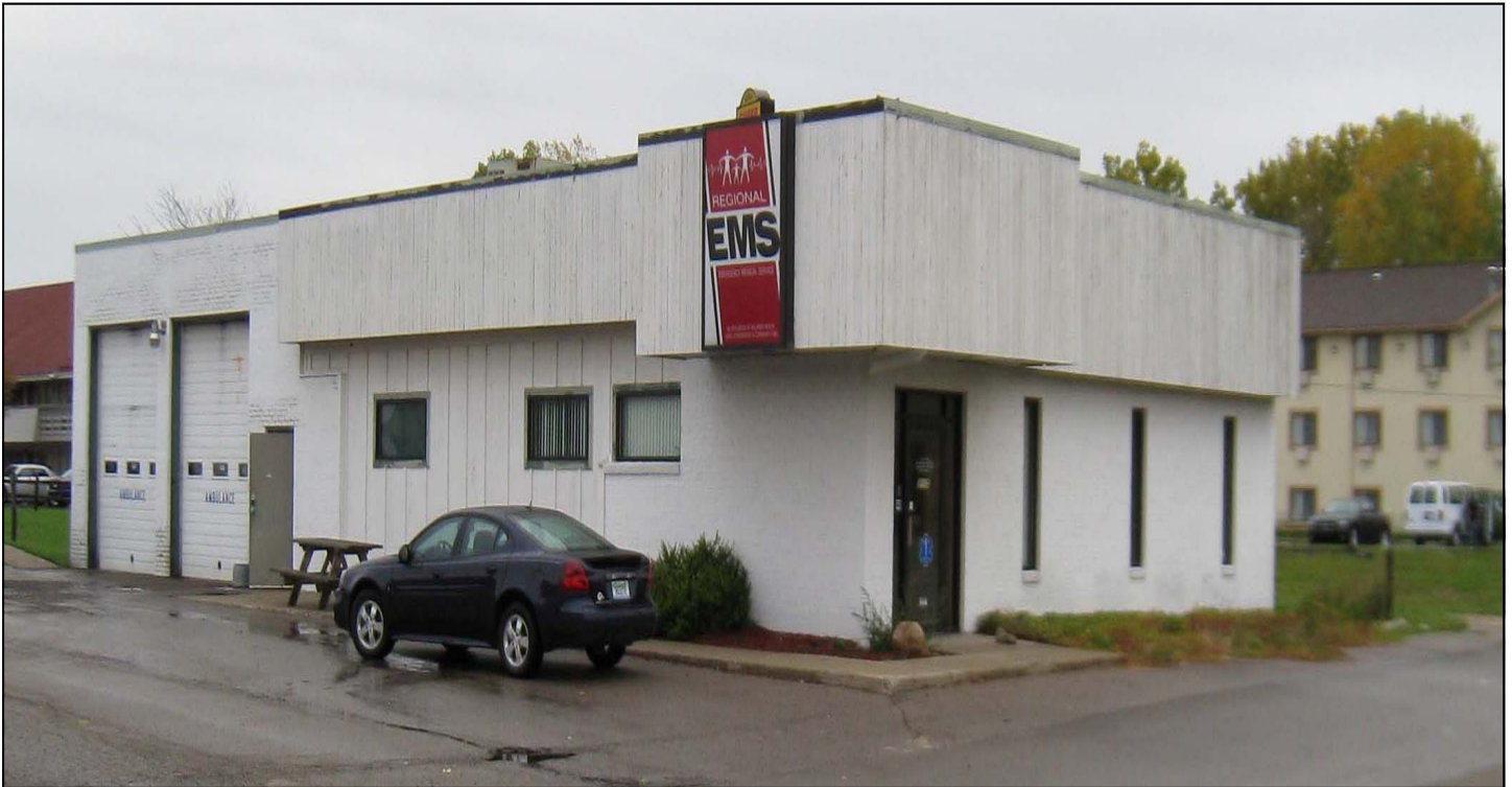
3005 Claude Avenue Flint, MI 48503

P. O. Box 310289 Flint, Michigan 48531 www.mdires.com 810-733-0760