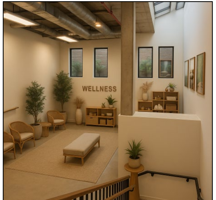
Renderings for illustrative purposes