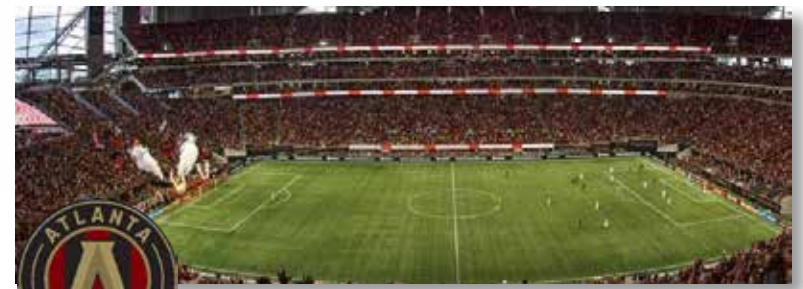
ATLANTA UNITED FC | MERCEDES-BENZ STADIUM