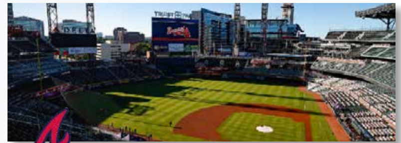
ATLANTA BRAVES | TRUIST PARK

The metro Atlanta area is home to 13 Fortune 500 and 24 Fortune 1000 headquarters. This includes the global headquarters of corporations such as The Coca-Cola Company, The Home Depot, Delta Air Lines, AT&T Mobility, UPS, Truist Bank, Mercedes Benz USA, Newell-Rubbermaid and is home to the world renowned Center for Disease Control.