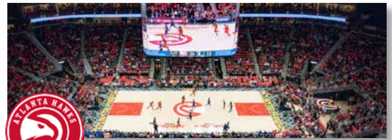
ATLANTA HAWKS | STATE FARM ARENA