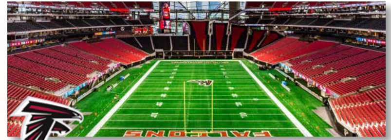
ATLANTA FALCONS | MERCEDES-BENZ STADIUM