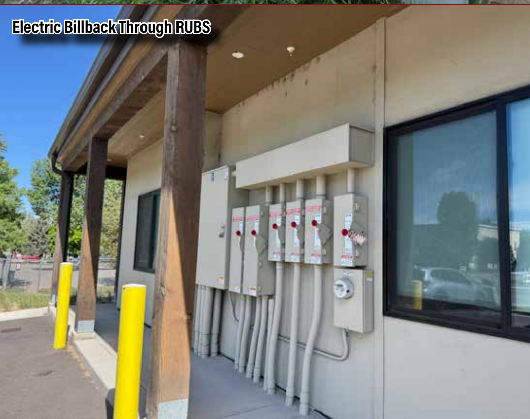
Electric Billback Through RUBS