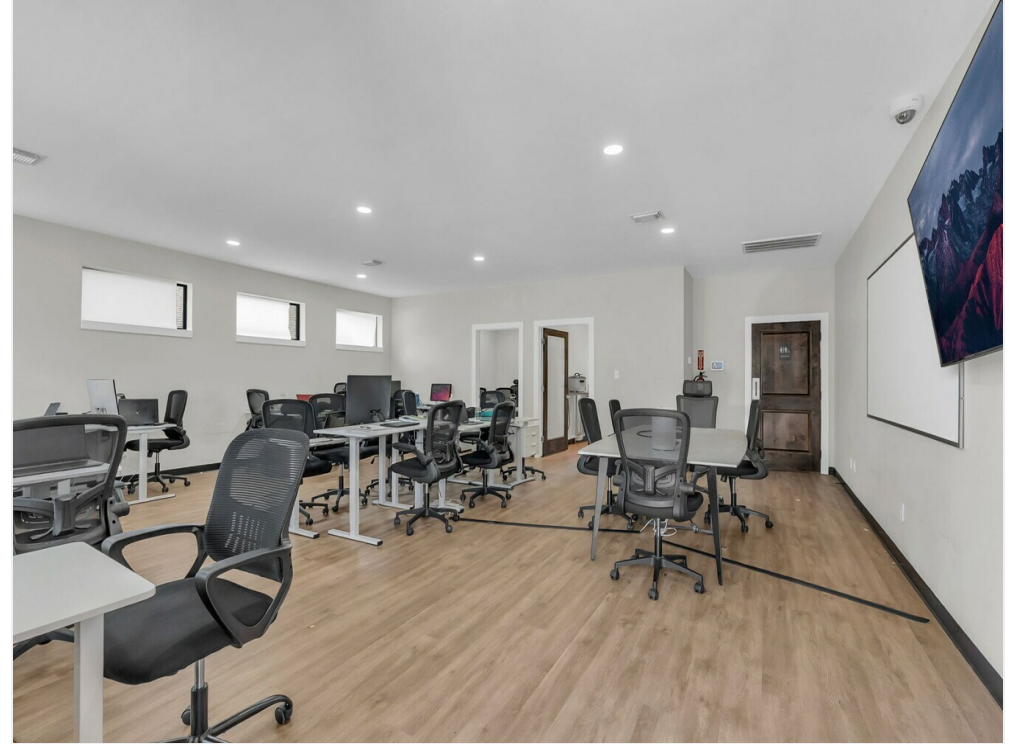
907 Otto 15