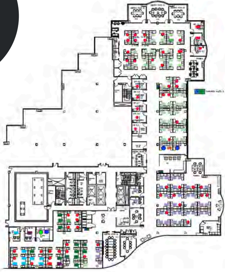
6TH FLOOR • 21,358 SF