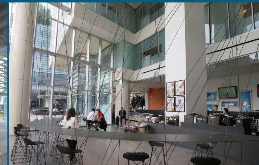
Kengo Kuma Designed Lobby Cafe