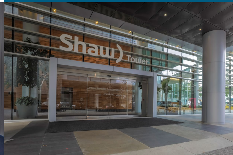
Office Tower Lobby Entrance