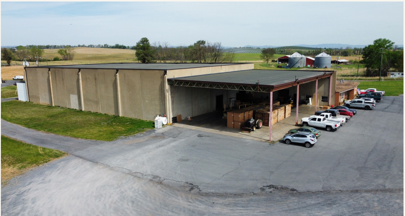
Low-level aerial showing the building, loading canopy, parking, and site access.