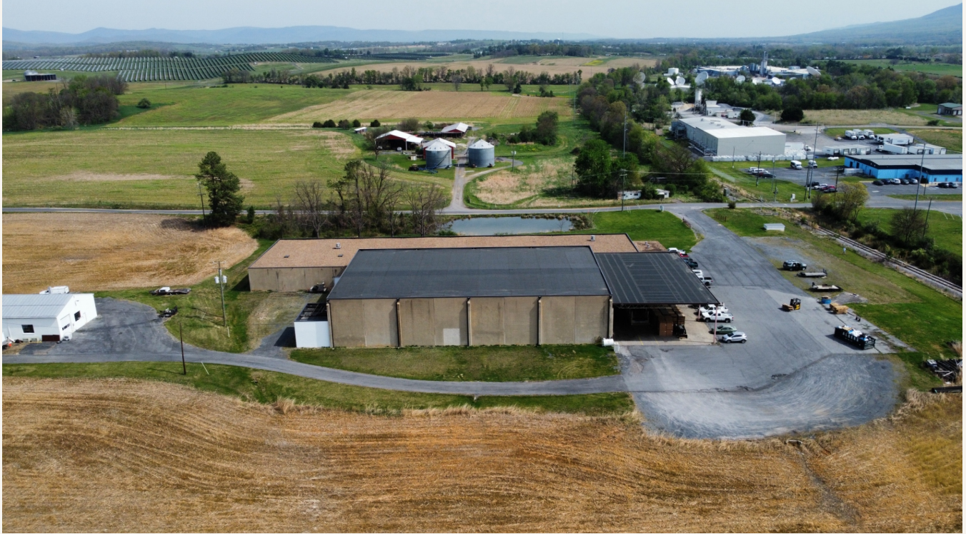
Aerial view of the property and surrounding Shenandoah Valley context.

1133 Wissler Road | Mount Jackson, VA 22842