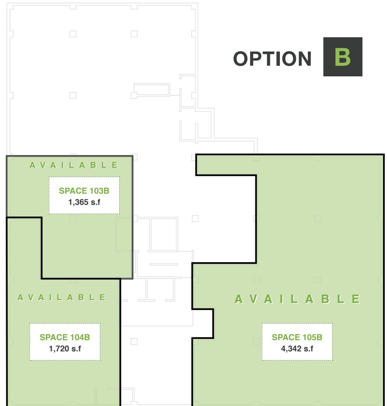
LOWER LEVEL SPACES 103B - 106B