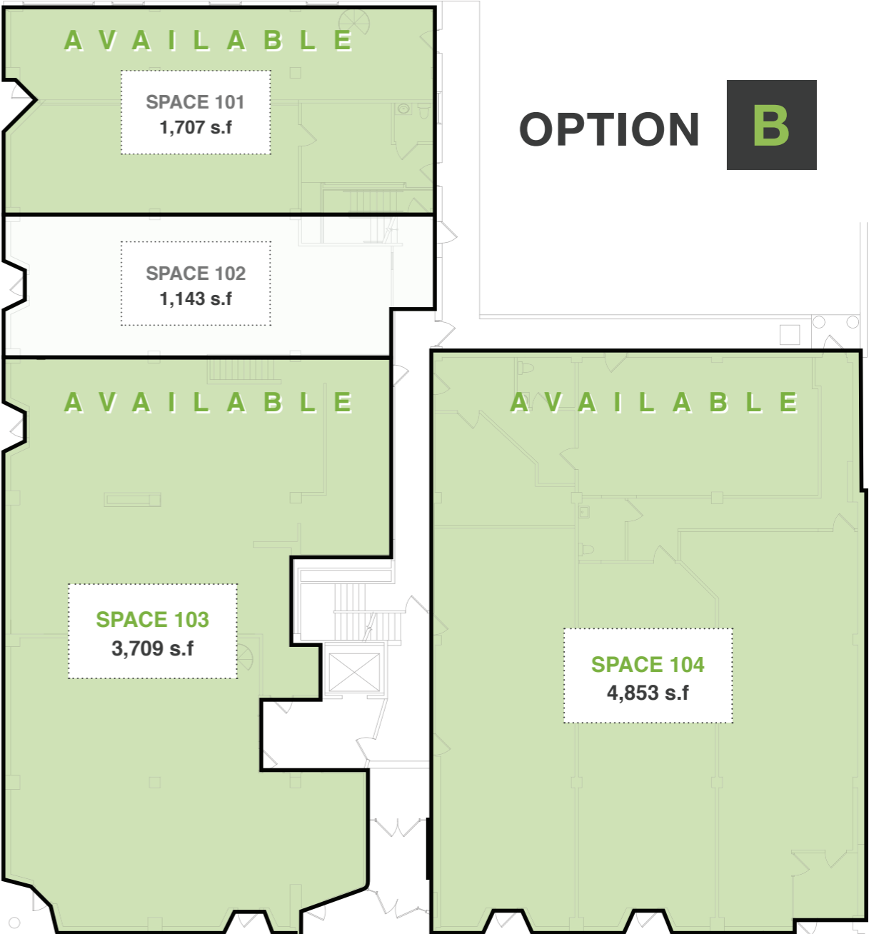
MAIN LEVEL SPACES 101 - 105