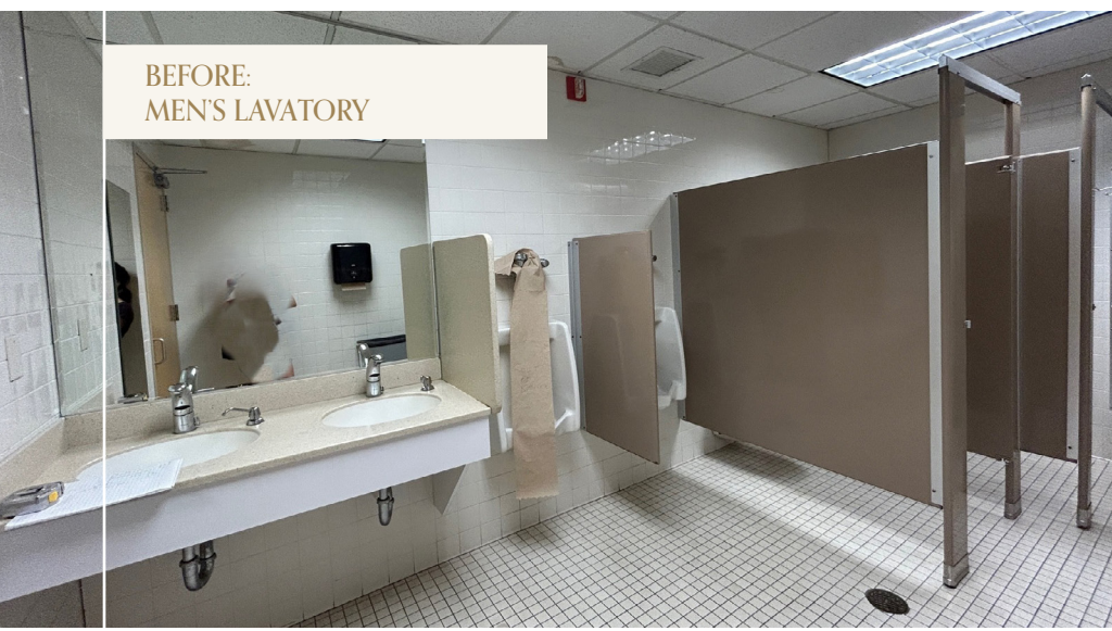
BEFORE: MEN'S LAVATORY