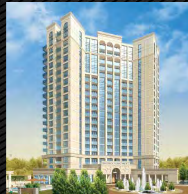
TUSCANY GATES MISSISSAUGA | COMPLETED