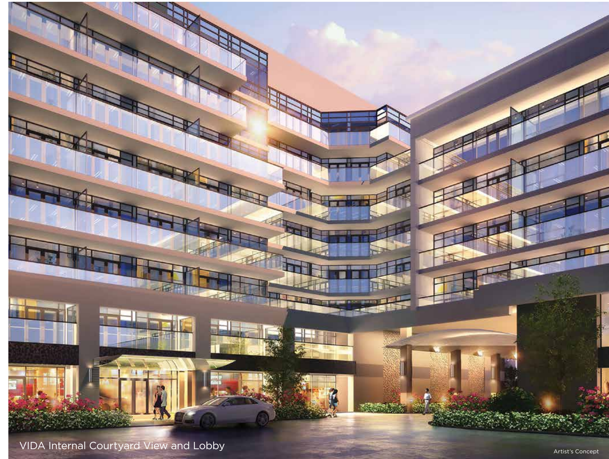
VIDA Internal Courtyard View and Lobby