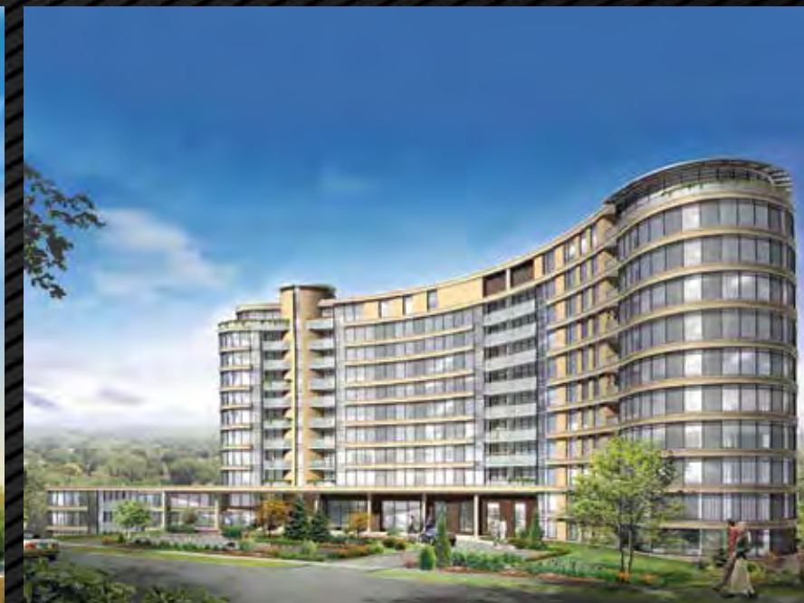
BELLAIR GARDENS YORK MILLS TORONTO | COMPLETED