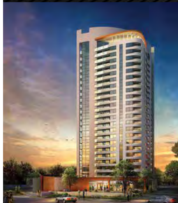
THE PALM NORTH YORK | COMPLETED