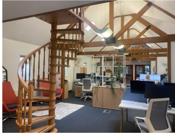
Ground floor office

The Ashlyns Hall Estate is immediately adjacent to the Chesham/Berkhamsted turning of the A41 which leads to J20 of the M25 only 13 miles away to the east, as well as to Aylesbury in the west. There is a mainline railway station in the town on the Silverlink line to London (Euston) with a regular service in a best time of around 29 minutes. When entering the Estate take the left fork with signs to 'The Pavilion'.