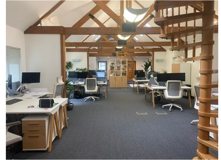
Ground floor office