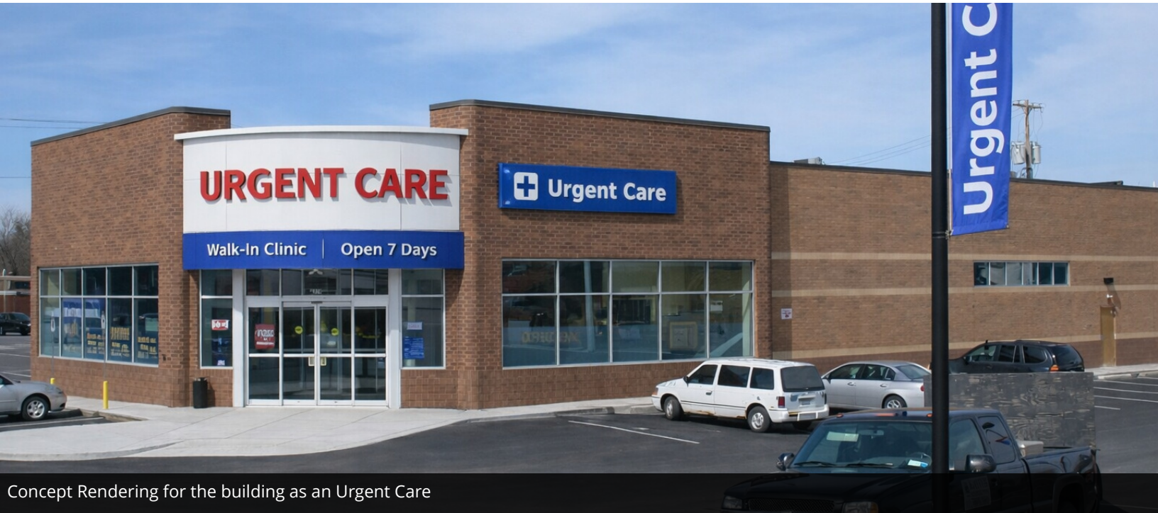
Concept Rendering for the building as an Urgent Care