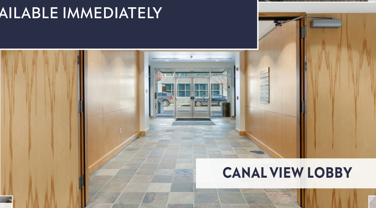
CANAL VIEW LOBBY