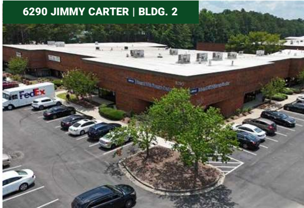
6290 JIMMY CARTER | BLDG. 2