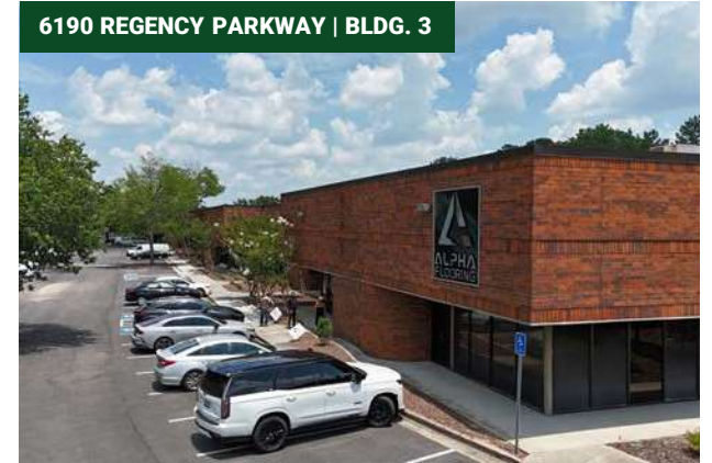
6190 REGENCY PARKWAY | BLDG. 3