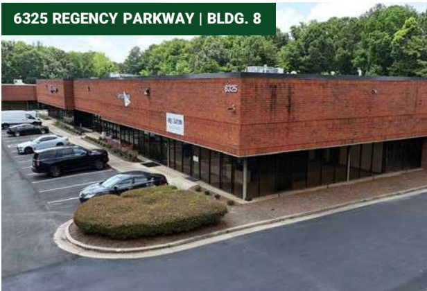
6325 REGENCY PARKWAY | BLDG. 8