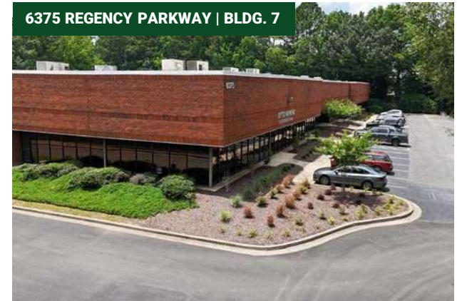
6375 REGENCY PARKWAY | BLDG. 7