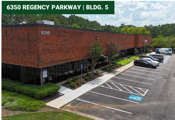
6350 REGENCY PARKWAY | BLDG. 5