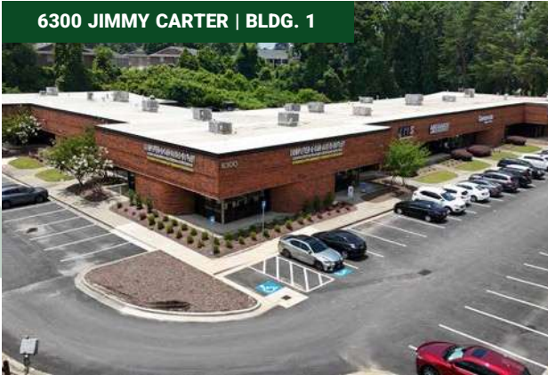
6300 JIMMY CARTER | BLDG. 1