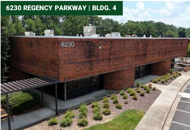
6230 REGENCY PARKWAY | BLDG. 4