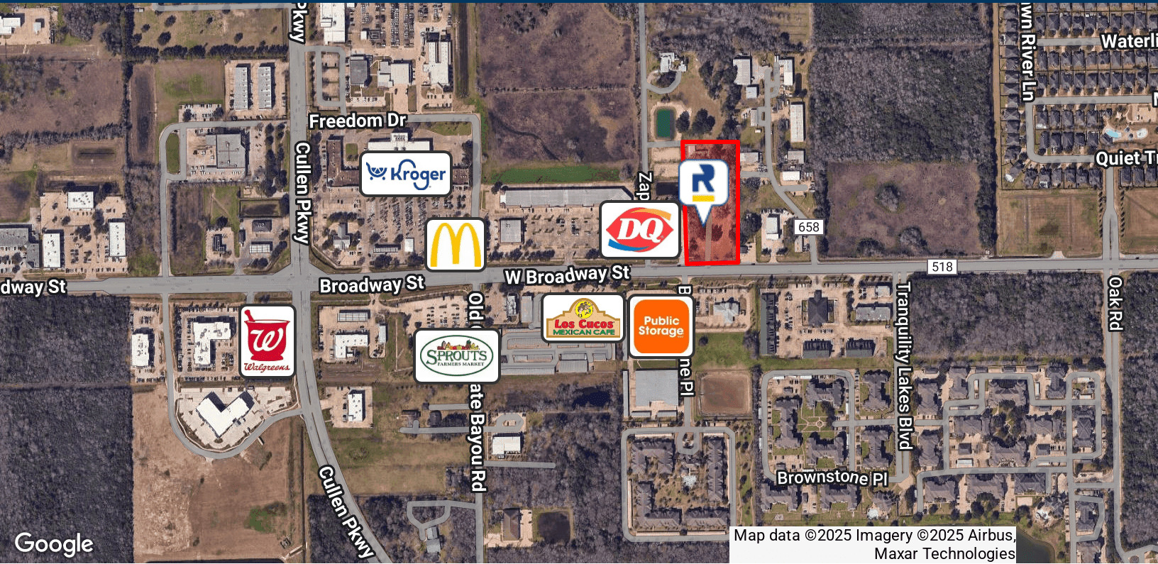
Map data ©2025 Imagery ©2025 Airbus, Maxar Technologies