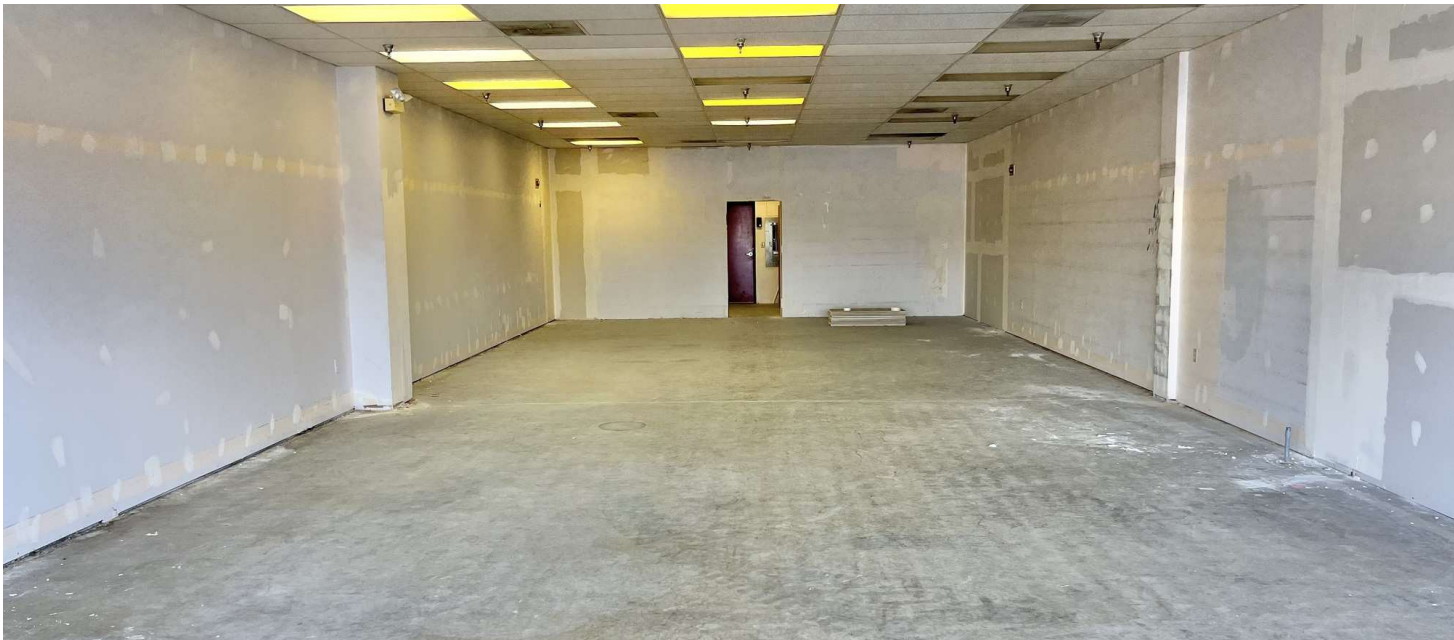
Suite 1A: 2,000 SF