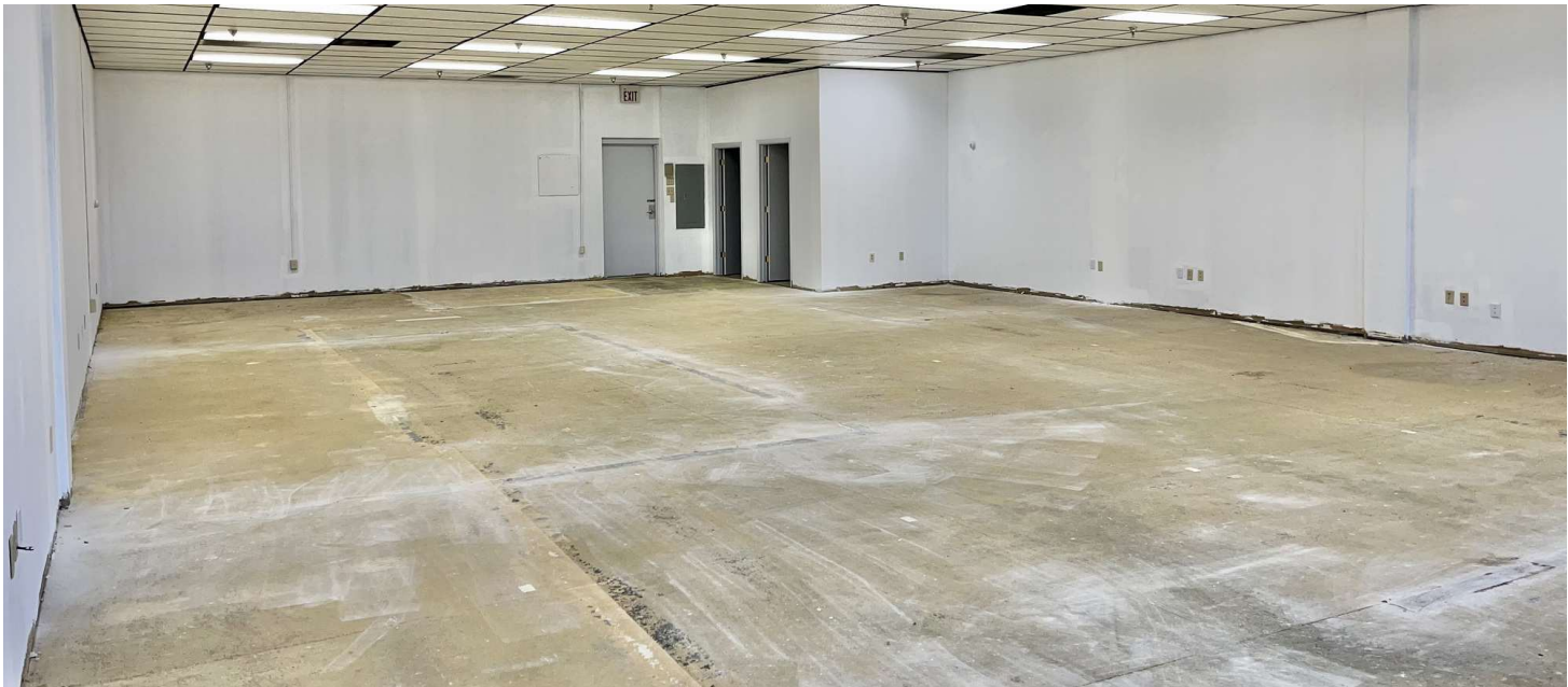
Suite 14: 2,100 SF

ALEX REED Broker 574.306.0790 areed@bradleyco.com