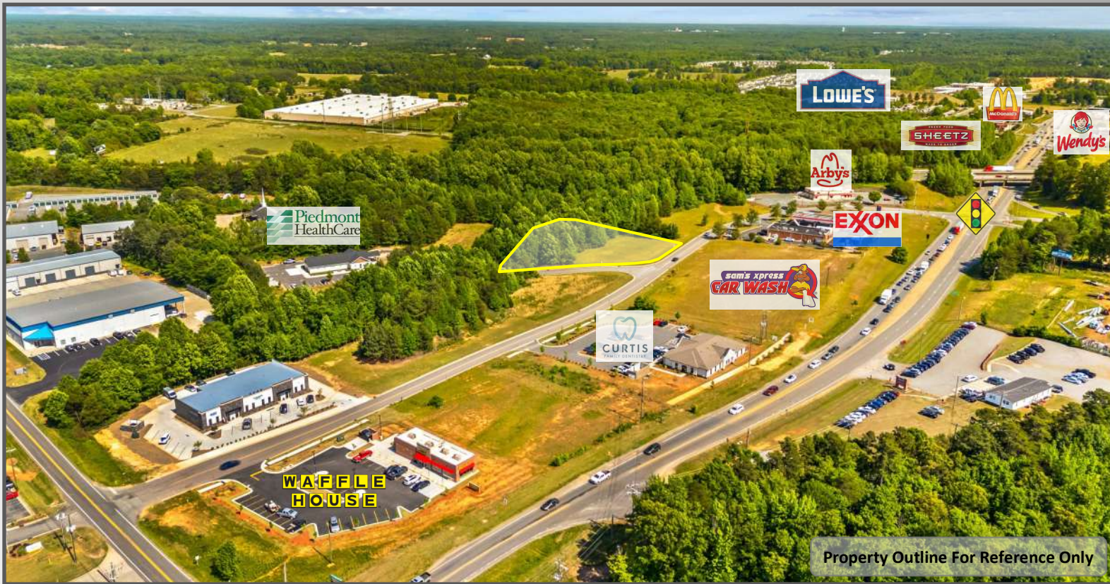
Property Outline For Reference Only