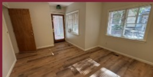
LIGHT FILLED OFFICE SPACE