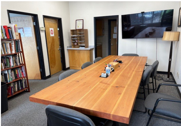
Reception Or Conference Room